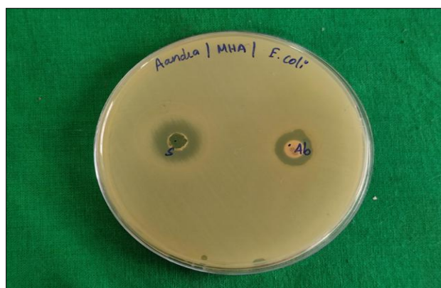
Fig 3: Depicts the Comparison of Escherichia coli inhibition zone measurement in four group intervention can be seen. The largest inhibition zone for E. coli bacteria resulted from the 10% concentration of Black Rice extract zone of 17mm, with a comparison of 14mm for the control group and each inhibition zone of each sample showed significant differences (p = 0.001)