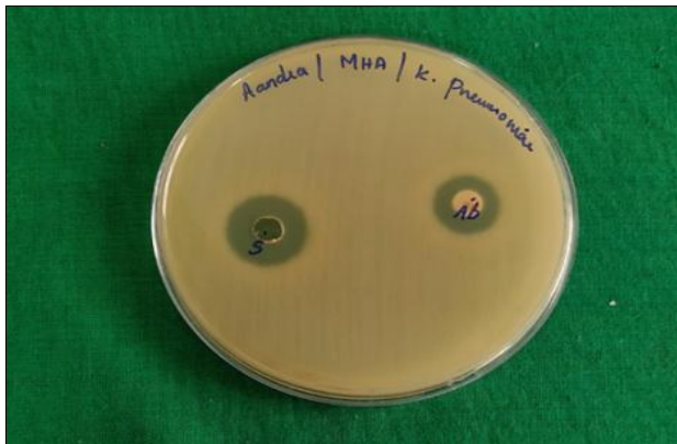
Fig 4: Comparison of Klebsiella pneumoniae bacteria inhibition zone measurement in four group intervention can be seen. The largest inhibition zone for bacteria resulted from the 10% concentration of Black rice extract zone 18mm with a comparison of 14mm for the control group and each inhibition zone of each sample showed significant differences (p = 0.000)