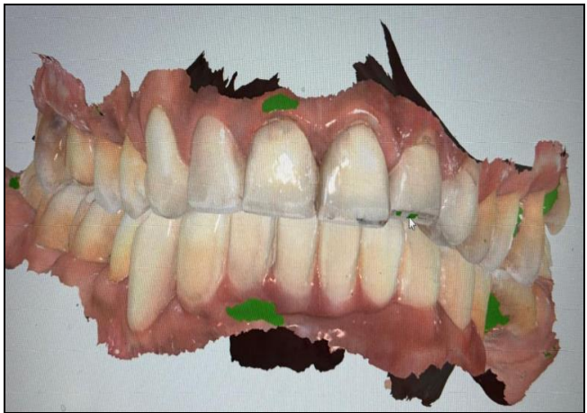
Fig 5: Intra oral scan of temporary (scan 2)

At the third appointment, the patient was scheduled for cementation of the definitive restorations. The internal surfaces of the all-ceramic crowns were etched using 8% hydrofluoric acid, rinsed thoroughly, and dried. A silane coupling agent was then applied to the internal surfaces and allowed to air dry. The prepared tooth surfaces were etched with 37% orthophosphoric acid for 30 seconds, rinsed thoroughly, and dried. A bonding agent was applied and