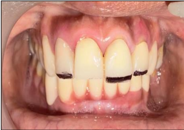
Fig 4: adjustment of temporary