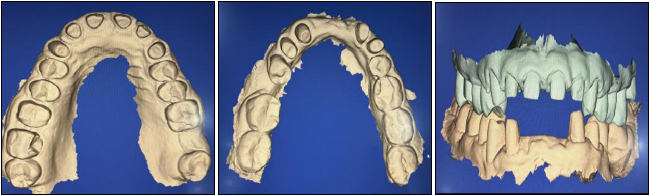
Fig 3: intra oral scan of the tooth preparation (scan1)