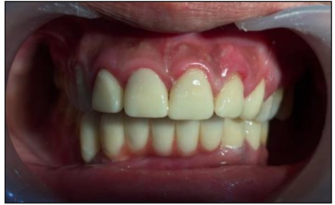
Fig 9: Final cementation of final prosthesis