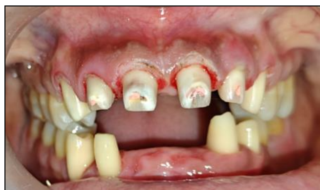
Fig 2: tooth preparation and gingivectomy

The scan obtained after tooth preparation and the scan of the approved provisional restoration were subsequently superimposed using Exocad software and CAD file was generated for final prosthesis (fig 6). This digital reference served as a guide for designing and fabricating the definitive prosthesis.