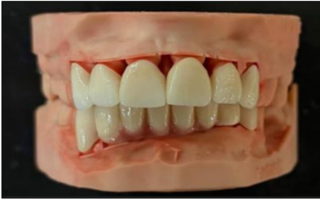
Fig 8: definitive prosthesis 3 layered zirconia crowns